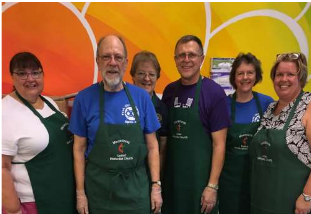
BELOW: Peak City Exchange club members serve lunch to the homeless in downtown Raleigh on October 6, 2018.