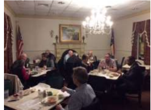
MEMBERS ENJOYING THEIR MEAL

Very interesting talk from the Judge. We found out he insists that those in the court room be dressed appropriately. Pants pulled up and shirttail tucked in.