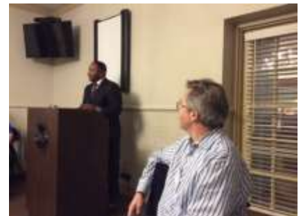
ALLEN & THE JUDGE